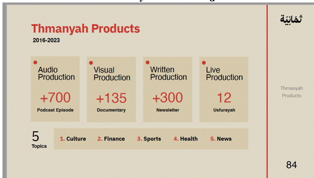
Source: Thmanyah Company Presentation, May 2023

Finjan is the most popular podcast in the Arab world and is currently the number 1 favorite podcast on the Apple Podcast Charts. Its most successful product results from over 300 published episodes, which have been listened to by over 128,000 listeners and viewed by over 342,000 viewers per