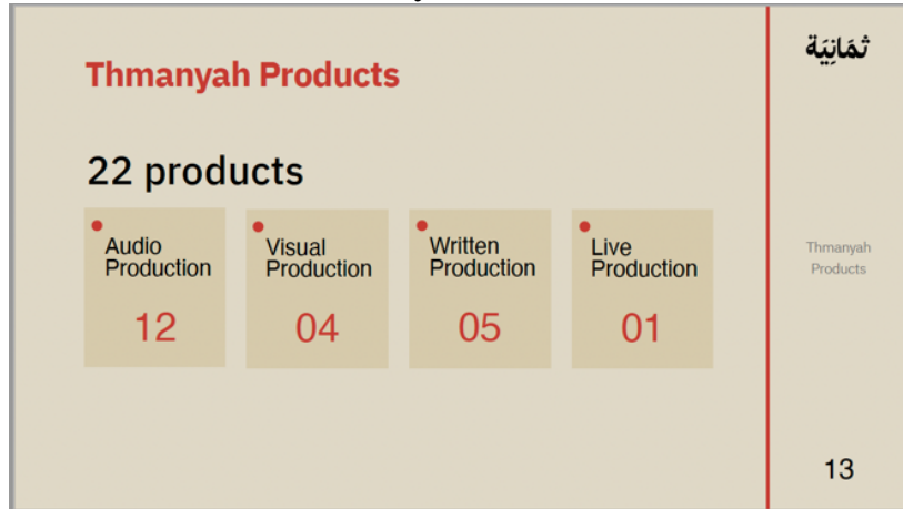
Exhibit I Thmanyah Products

Source: Thmanyah Company Presentation, May 2023, provided by Thmanyah